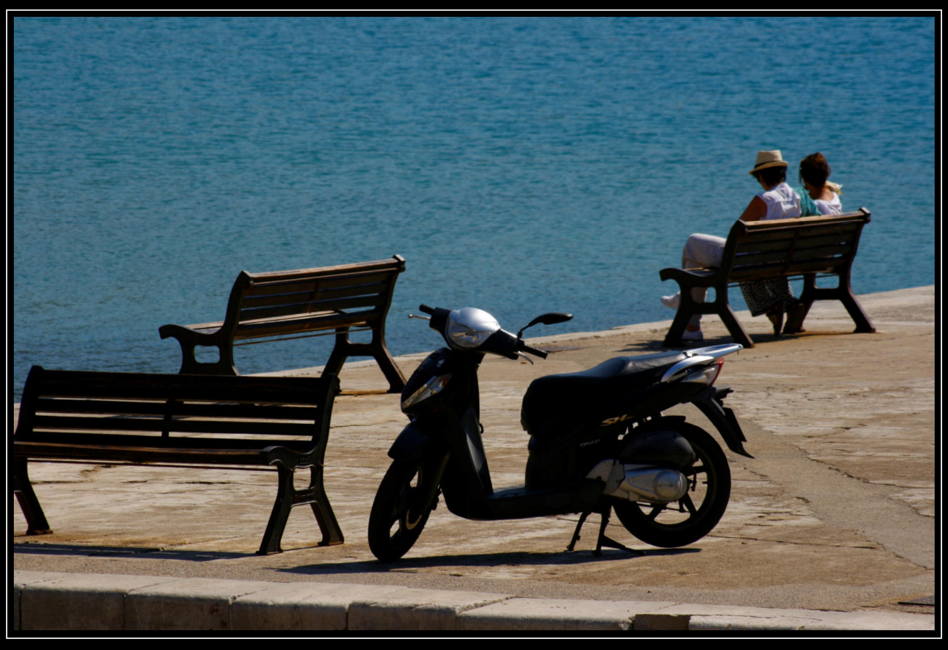
Pause. Come to a rest. Each chapter for your life journey needs its time of back-pedaling, resting and sensing longings. ☺

A nice place at the waterfront of Cefalù invites to linger and eating ice cream (Northern Coast) – June 2014