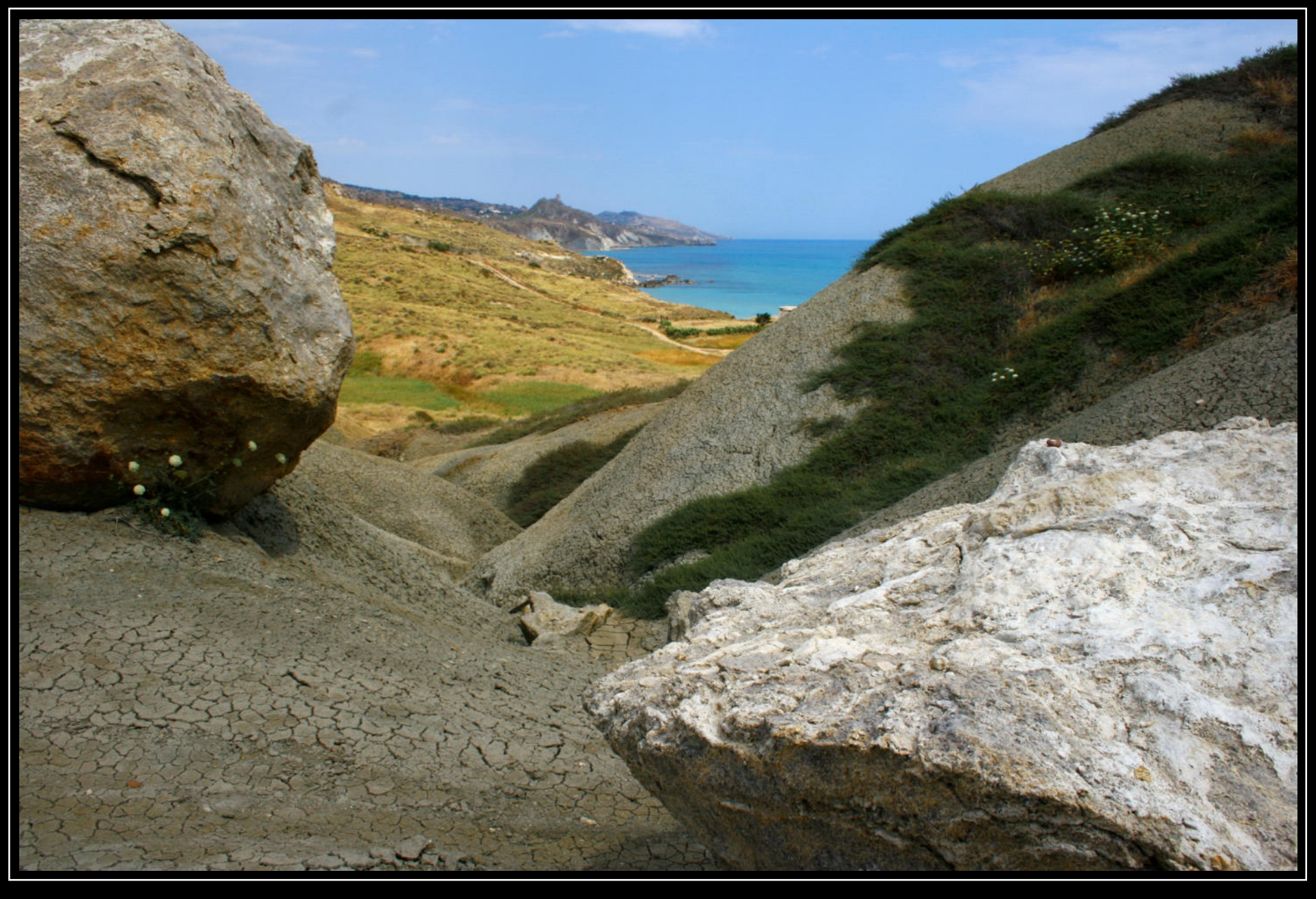
Sometimes the way of life seems to become narrow. Often this is just a sign that you are shortly before a break through. © View on a lonely and hard to access bay with bizarre rock formations near the touristic place San Leone (South-West) – June 2014