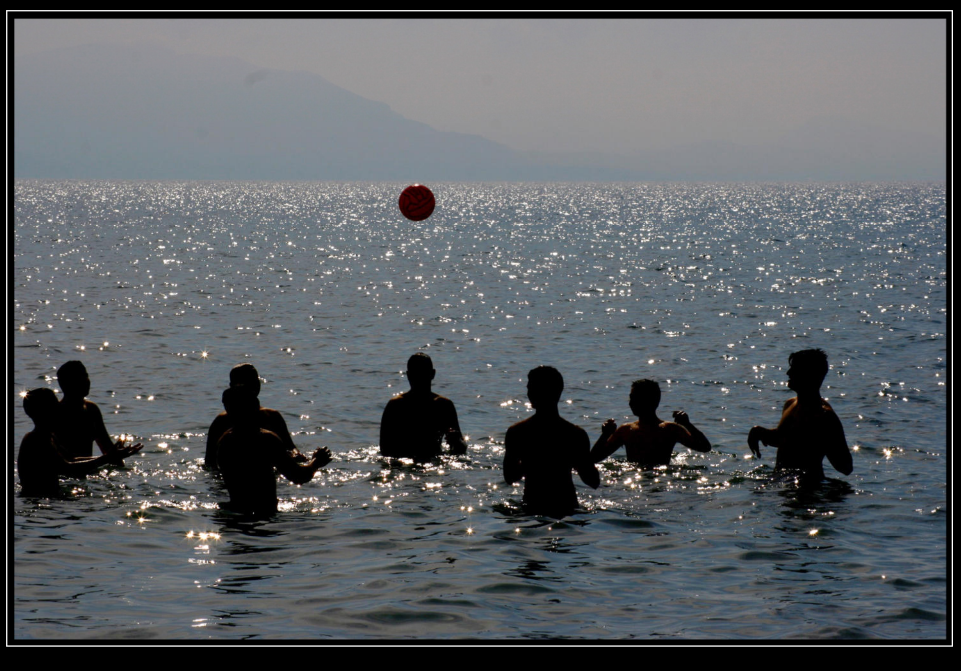
Play. Your heart longs for a sparkle of infantine impartiality and carefreeness. © Bathing men enjoy playing ball without competition in the gently shelving beach near Campofelice de Rocella (Nordküste) – June 2014