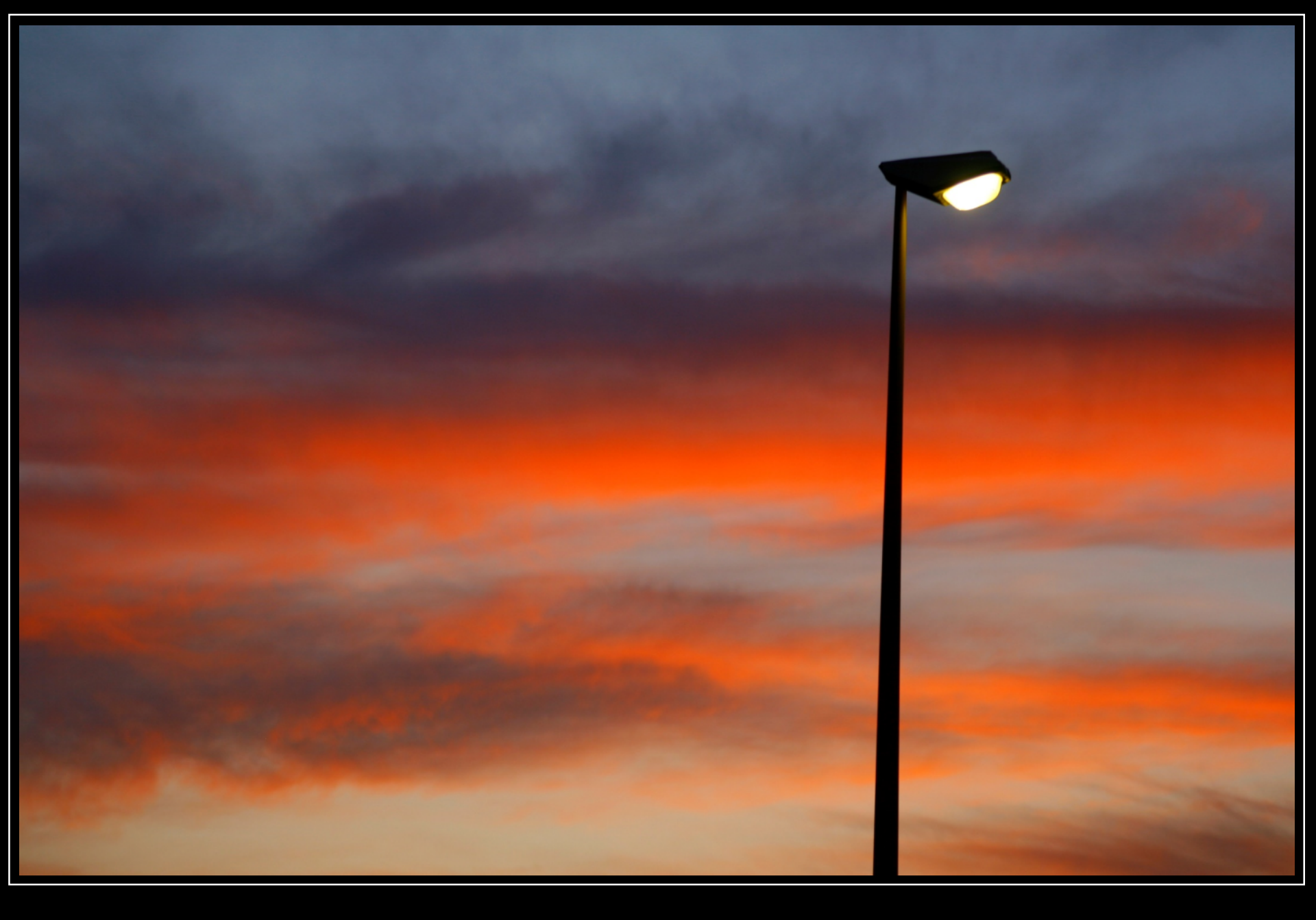
• If it is getting dark around you light the fire, which burns inside you till the last breathe. Bonus-Picture: Picturesque sunset is support by artificial light near our hotel Baia di Ulisse in San Leone (South West) – June 2014