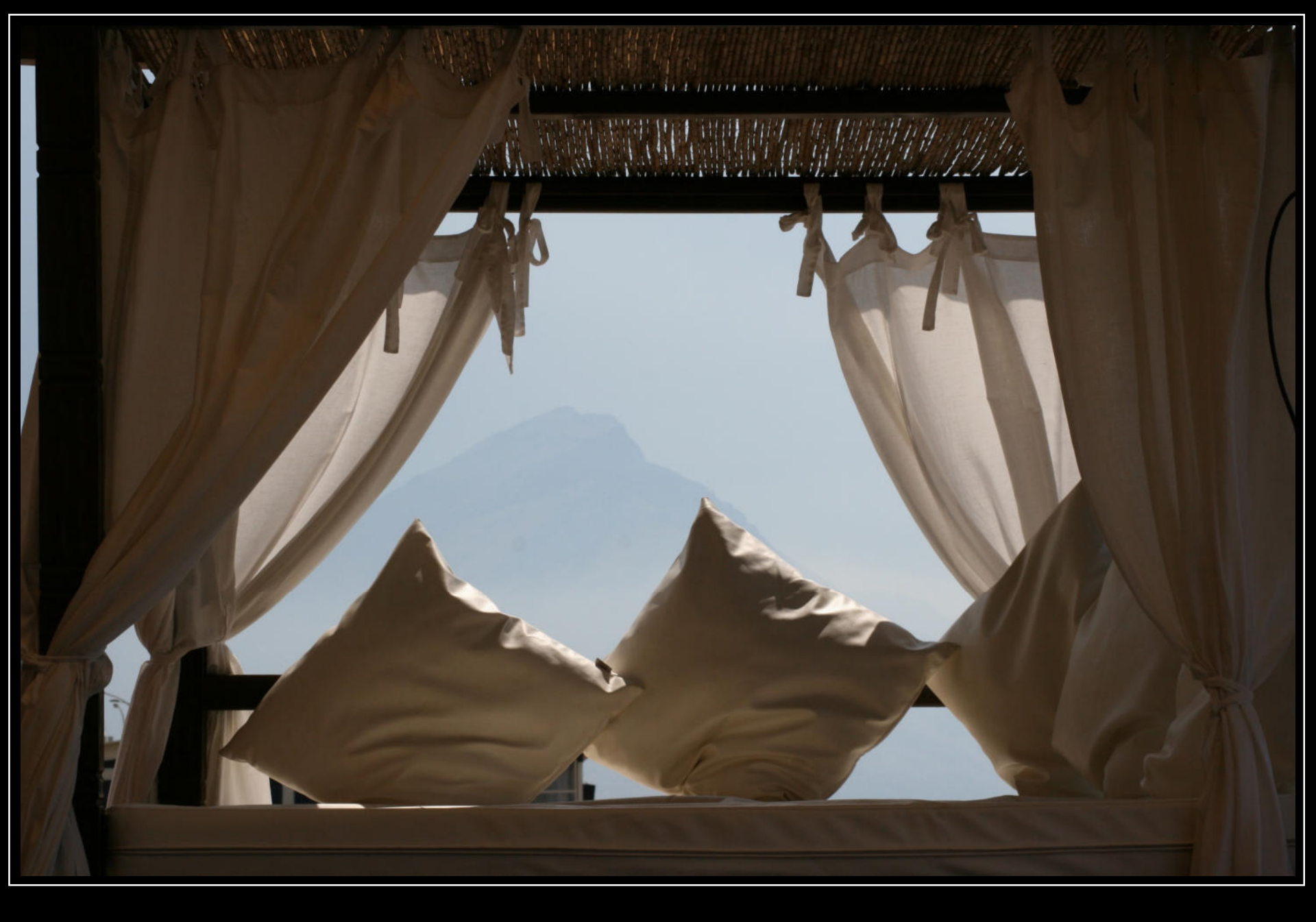
© Cuddling gives you warmth for the heart and dreams the fuel for distant goals. © Restaurants along the Flanier beach of Campofelice de Rocella offer not only good food but also relaxation options (Northern Coast) – June 2014