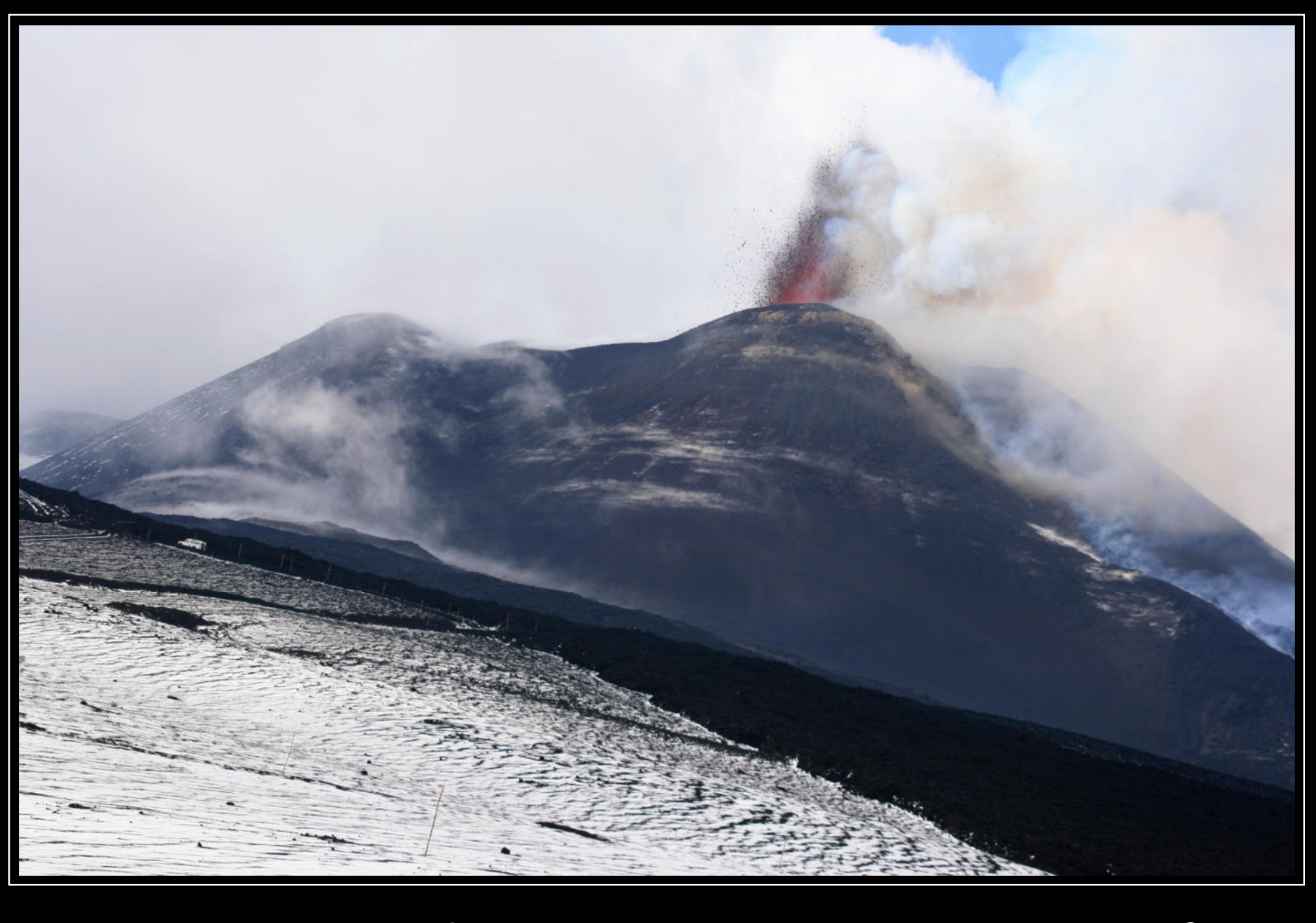
© Break out. Deep inside of you dozes a divine I, that wants to be listened and sensed. © Europe's largest volcano Etna (3.369 m) sprays harmless lava, after a summery snowfall has covered its mantle (North East) – June 2014