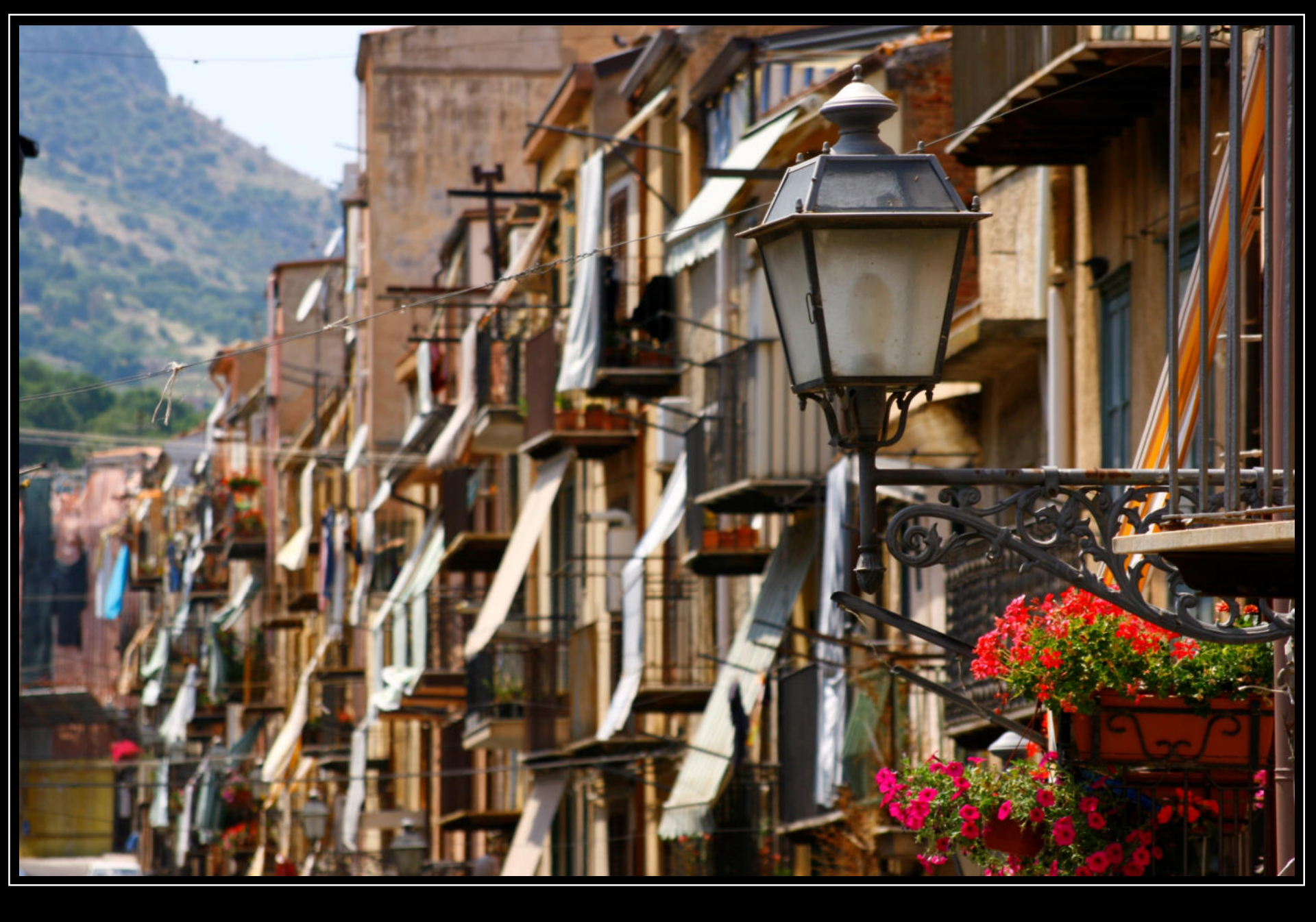
Home is where your heart develops the highest illuminating power. © The houses of Castelbueno are embellished with clotheslines, sun protection, satellite dishes and balcony plants (Northern Coast) – June 2014