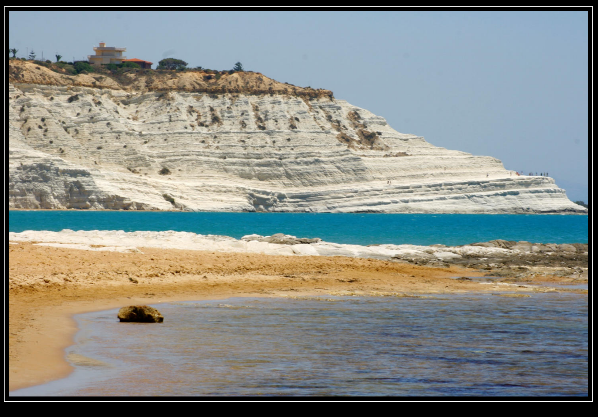
© If your goals seem to be too far away, look for a sandbank to rest and get new inspirations. © Beautiful limestone formations and lonely bays are offered by the whitewashed Scala dei Turchi near Siculiana Marina (South West) – June 2014