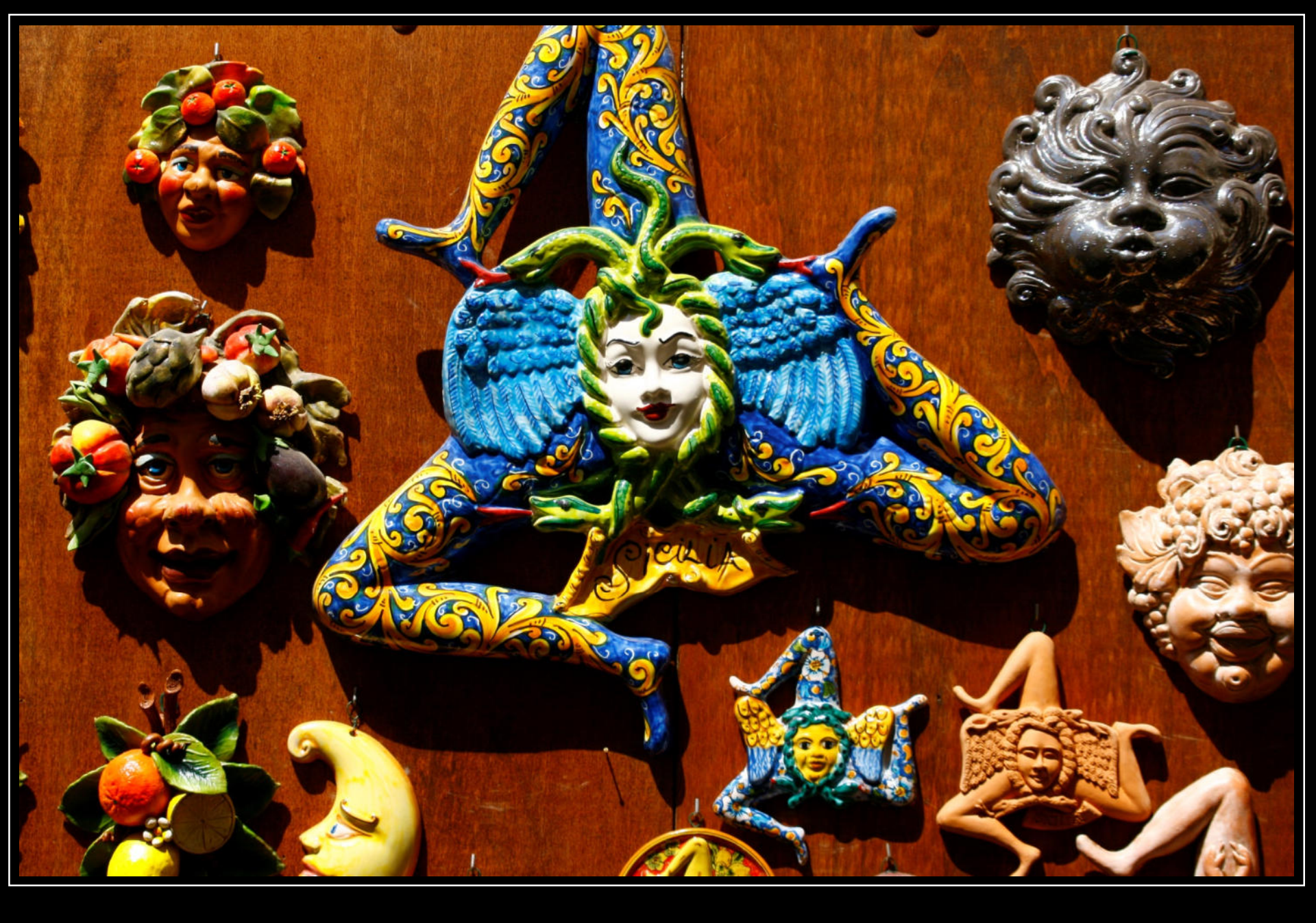
● If you believe you will be faster with three legs, you should also try with three heads. ⊕ The Sicilian crest, the Triskele, an ancient symbol for sun and lifework decorates the way to the cathedral of Monreale (Northern Coast) – June 2014