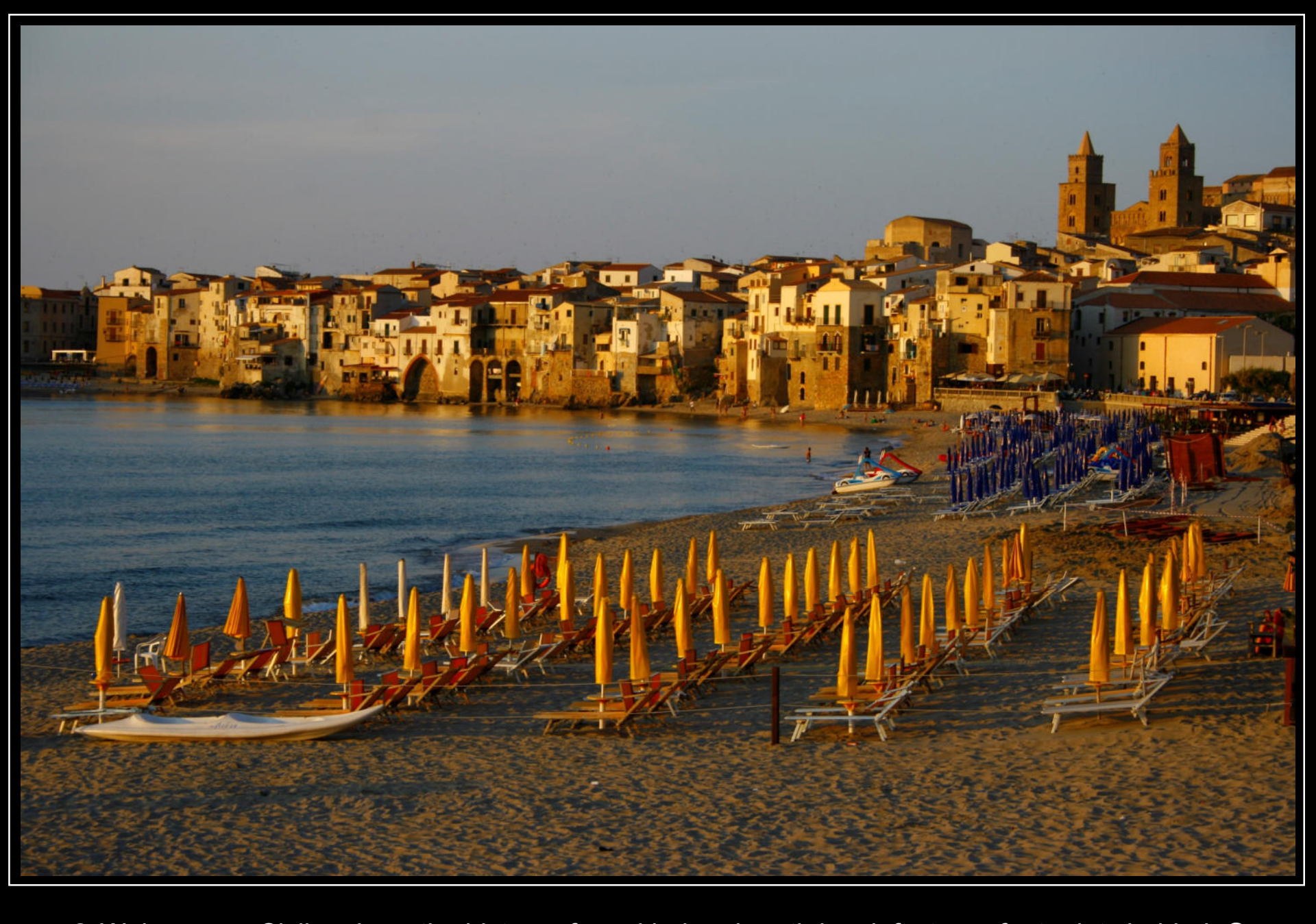
• Welcome on Sicily, where the history of mankind and earth has left strong foot prints behind. The collapsed umbrellas at the beach of Cefalù appear reverent compared to the oldest Norman's church in town (Northern Coast) – June 2014